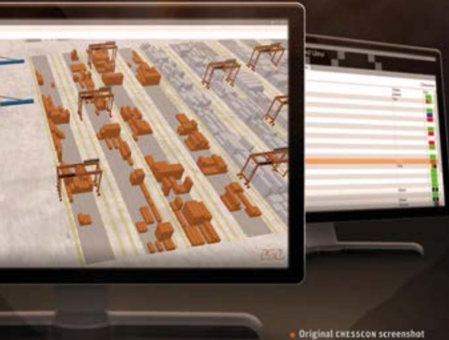
Original CHESSCON screenshot