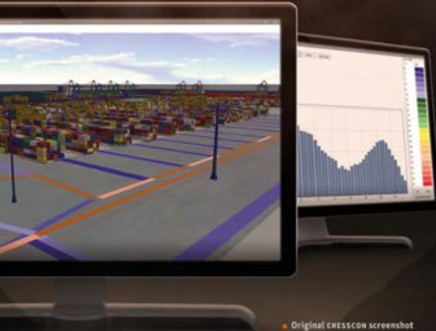
Original CHESSCON screenshot