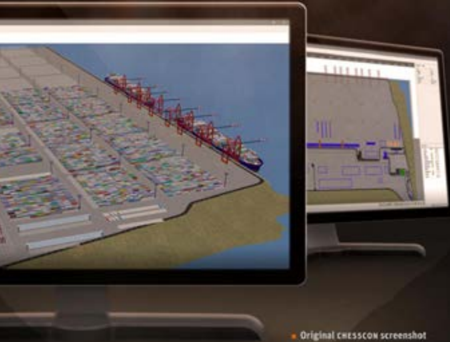
Original CHESSCON screenshot